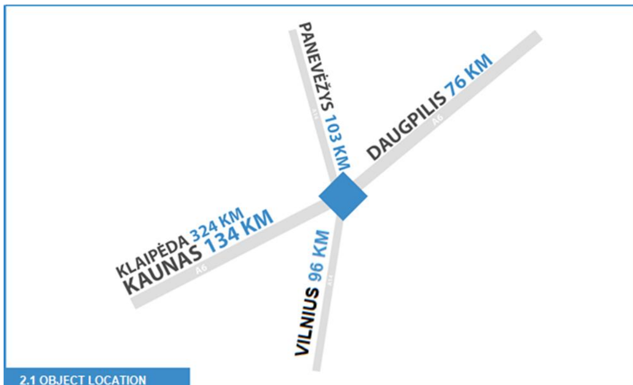
2.1 OBJECT LOCATION