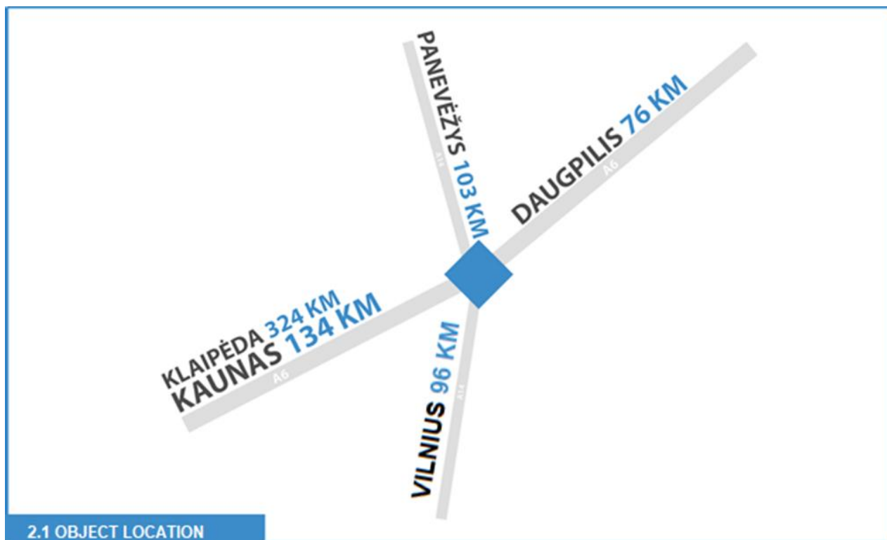
2.1 OBJECT LOCATION